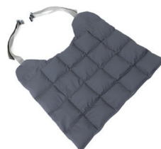
Weighted blanket lap model