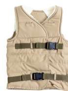
Weighted vest junior - adult

Please visit our website for more information