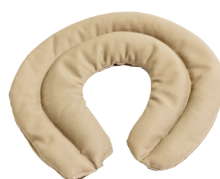
Weighted blanket neck model junior - adult